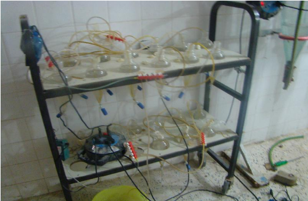
Fig. 1. Photograph for system of the artificial hatching.